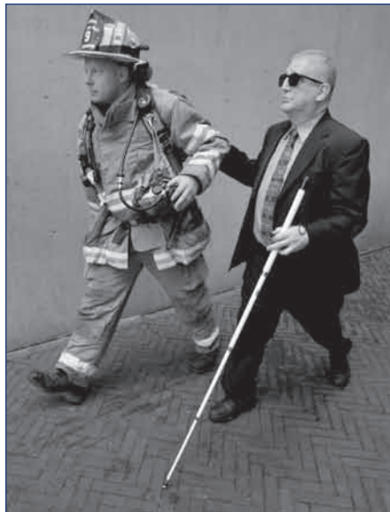
A man who is blind is assisted by an emergency responder in an evacuation.

Although crisis-focused interest is understandable, the truth is that the kinds of changes needed to promote the inclusion of people with disabilities and older adults in emergency systems must come before disasters, not in the midst of them. Infrastructure change must occur so that transportation, communication, shelter and other disaster systems are fully accessible to people with disabilities before disaster strikes – so that people like Benilda are not left to die.