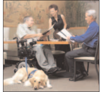
Allowed in Public Places