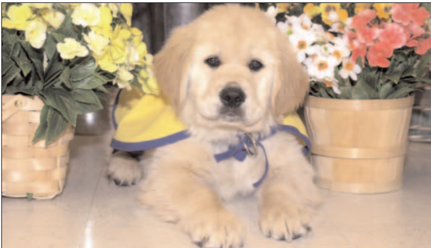
Service Animals in Training - some state laws may grant access