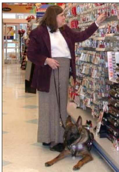
Businesses that serve the public must allow people with disabilities to enter with their service animal

Under the Americans with Disabilities Act (ADA), businesses and organizations that serve the public must allow people with disabilities to bring their service animals into all areas of the facility where customers are normally allowed to go. This federal law applies to all businesses open to the public, including restaurants, hotels, taxis and shuttles, grocery and department stores, hospitals and medical offices, theaters, health clubs, parks, and zoos.