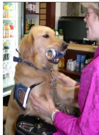
Service animals are individually trained to perform tasks for people with disabilities

If you have additional questions concerning the ADA and service animals, please call the Department's ADA Information Line at (800) 514-0301 (voice) or (800) 514-0383 (TTY) or visit the ADA Business Connection at www.ada.gov